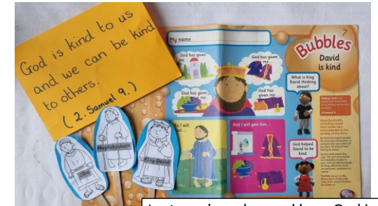
Last week we learned how God is kind to us and how we can be kind to others, (2 Samuel 9). We did some colouring and made puppets to remind us of the story of David and Mephibosheth.

We invite children of all ages, with their adults, to come into the Lady Chapel during part of the service, and share in A Godly Play (a short visual storytelling of scriptures, with wondering questions, stories, crafts, puzzles, and even some acting for those that want ... for all ages to share together; then various age related activities). This week we conclude our series, David the King. We discover that, even when God's friends do something wrong, God loves them and wants to forgive them (2 Samuel 11.1 – 12.15).