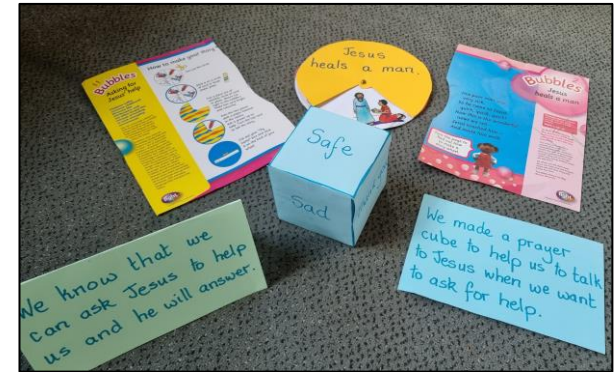
Last Sunday we learned how Jesus cured a man of his leprosy ( Mark 1. 40-45 ), learning that we can ask Jesus to help us and he will answer.