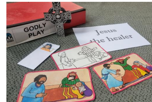
Last Sunday we learned how Jesus is able to heal people who are ill (Mark 1. 29-39), sharing the story of Jesus healing Peter's mother-in-law.

We invite children of all ages, with their adults, to come into the Lady Chapel during part of the service, and share in A Godly Play (a short visual storytelling of scriptures, with wondering questions, stories, crafts, puzzles, and even some acting for those that want ... for all ages to share together; then various age related activities). We also have an older group breakout session most weeks. Today, we continue our series on Jesus the healer, this week find out how Jesus cured a man of his leprosy (Mark 1. 40-45).