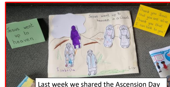
Last week we shared the Ascension Day story ( Acts 1. 1-11 ) and made a collage: thanking Jesus that he is alive and that we can talk to him.