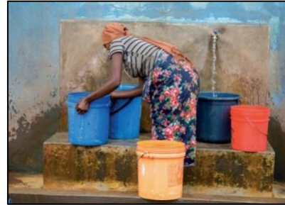
A woman collects water from a communal tank in the Resettlement Centre of Marrupa, Mozambique

for those in Mozambique who have been traumatised and displaced by conflict. Your support will help on-the-ground, local church partners to reach the most vulnerable; helping to change lives, transform communities and show God's love where it is needed most. There will be another opportunity to give to the appeal on Sunday 9 th and Wednesday 12 th October, if you would like to do so.